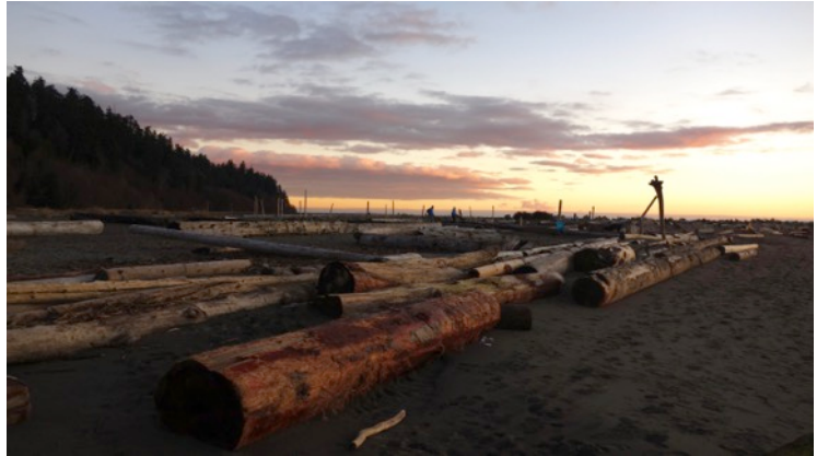
Wreck Beach, UBC Campus

In the afternoon, all the clubs are presented outside on Main Mall, and you can choose which one(s) you would like to attend. There really are a lot of opportunities for you to engage yourself and make new friends.