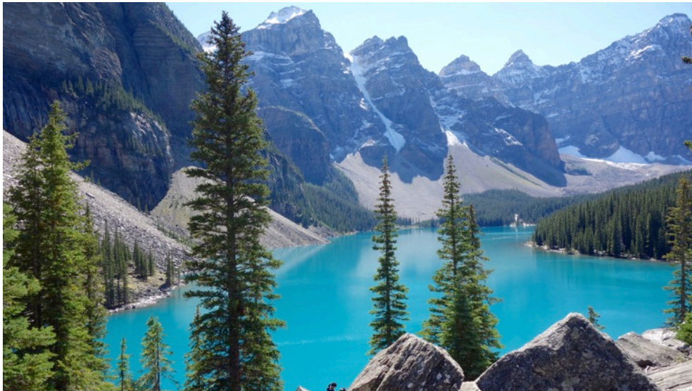
Moraine Lake, Alberta

Experience Report Bachelor Business Administration, 5th Semester Study Abroad Programme