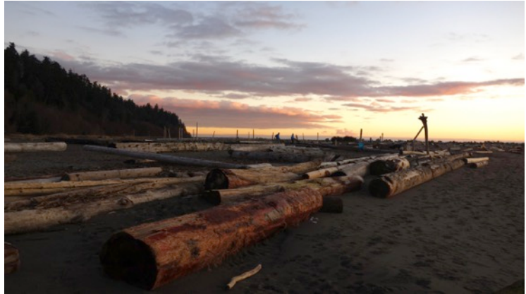
Wreck Beach, UBC Campus

In the afternoon, all the clubs are presented outside on Main Mall, and you can choose which one(s) you would like to attend. There really are a lot of opportunities for you to engage yourself and make new friends.