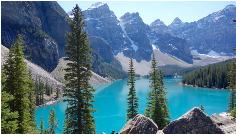
Moraine Lake, Alberta

Experience Report Bachelor Business Administration, 5th Semester Study Abroad Programme