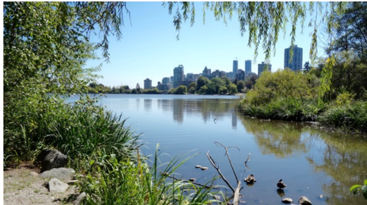
View from Stanley Park on Downtown Vancouver

Since I preferred an englishspeaking country and wanted to go further away (not Europe), the only possibilities were Canada and USA. While informing myself about the few partner unis in these countries, I quickly realized that the University of British Columbia in Vancouver would be the absolute dream: located in the heart of Vancouver, one of the most liveable cities in the world, on a beautiful campus, next to the ocean and close to huge mountains, with a big variety of courses and an excellent reputation among American business schools. Unfortunately, there's only one place for Bachelor students each semester. Thus, I put a lot of effort into my application documents for the ZIB, especially the motivation letter.